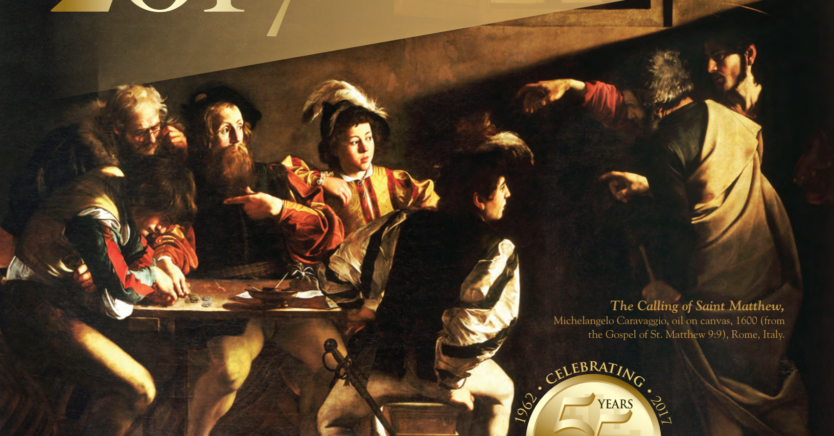
The Calling of Saint Matthew, Michelangelo Caravaggio, oil on canvas, 1600 (from the Gospel of St. Matthew 9:9), Rome, Italy.

INTERNATIONAL CATHOLIC STEWARDSHIP COUNCIL