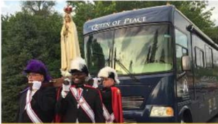
Visit San Diego 'where it all started'

COME CELEBRATE THE STORIED HISTORY OF CATHOLICISM IN CALIFORNIA